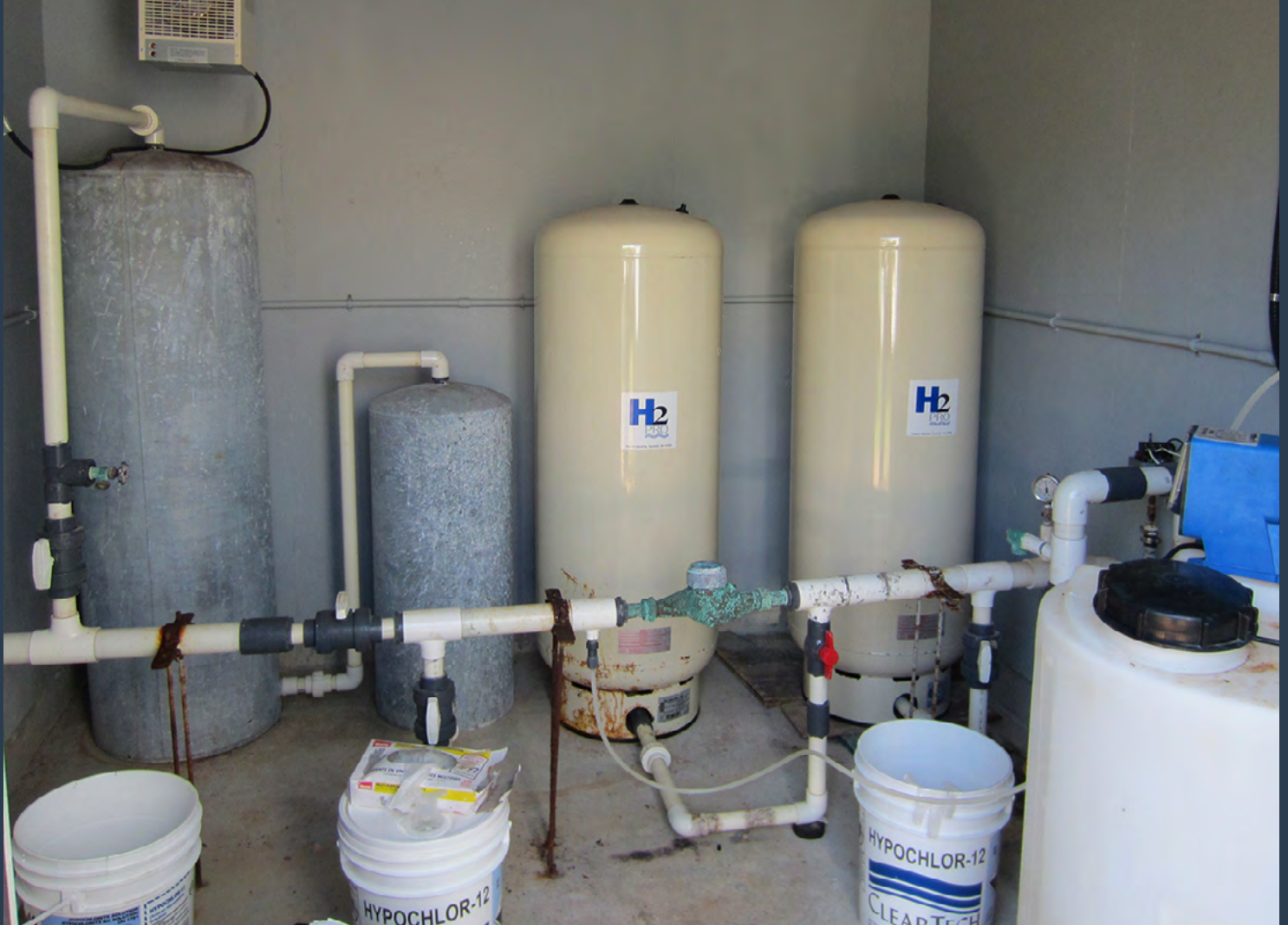
Water treatment plant in Shoal Lake 40.