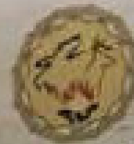
Moose Deer Point First Nation