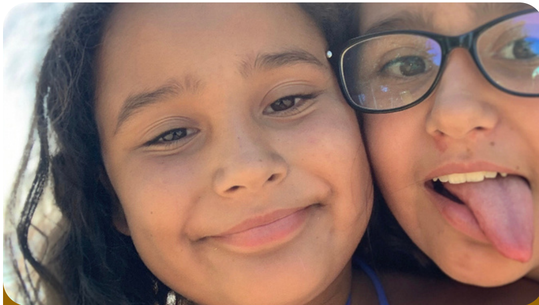
2017 Language Camp Grief and the Elders Tent

Group knowledge- what other ways have been useful in approaching loss of language grief