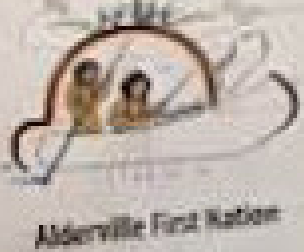
Alderville First Nation