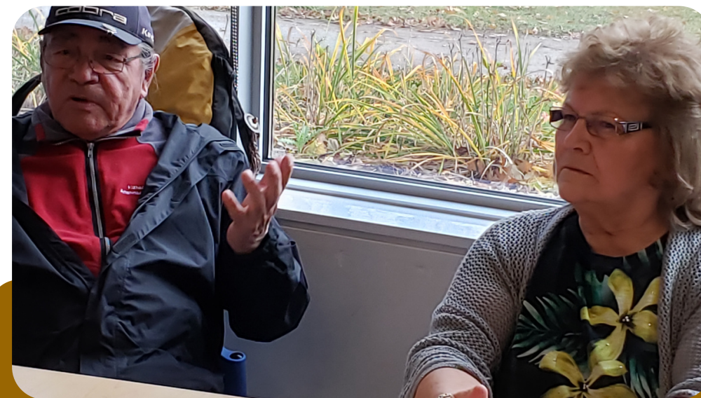
OTC AGM Elders Do something!

Group knowledge- what other ways have been useful in approaching loss of language grief