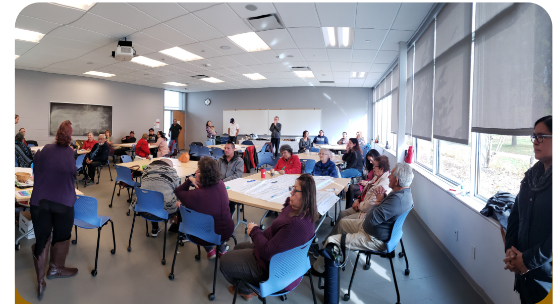
2019 Language Champions Gathering Regional Priorities

Poll: What four regional priorities would you identify in your region?