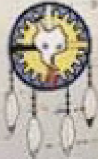
Beadville First Nation